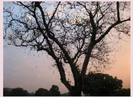
Evening : As Seen somewhere from Rose Garden IAC-2007 Chandigarh