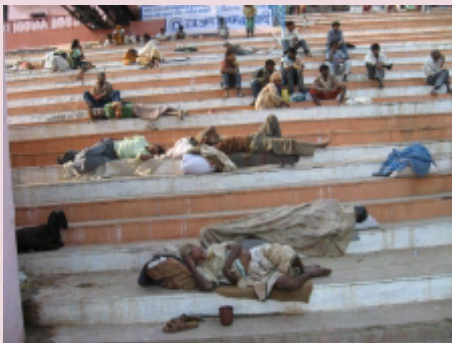
Rain Basera : Famous Ghats of Banaras IAC-2007 Allahabad

IAC Archives : Nothing scientific about it. Send interesting photographs from your paper albums or digital file. Reminiscences of past IAC conferences. From the venue or around.