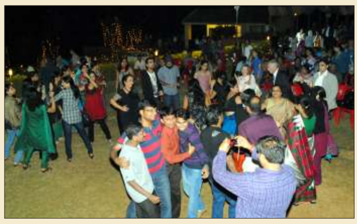
Generation X Enjoying Banquet