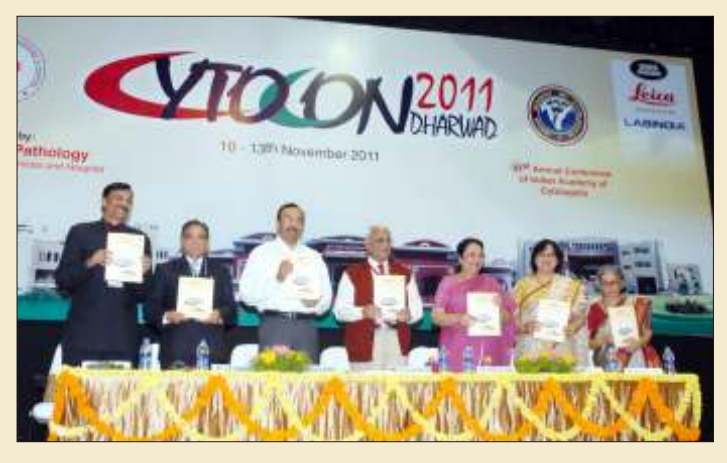
Release of Souvenir