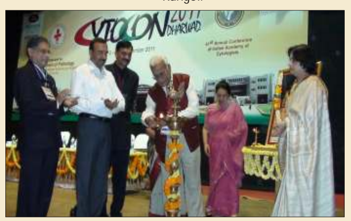
Inauguration of Cytocon2011