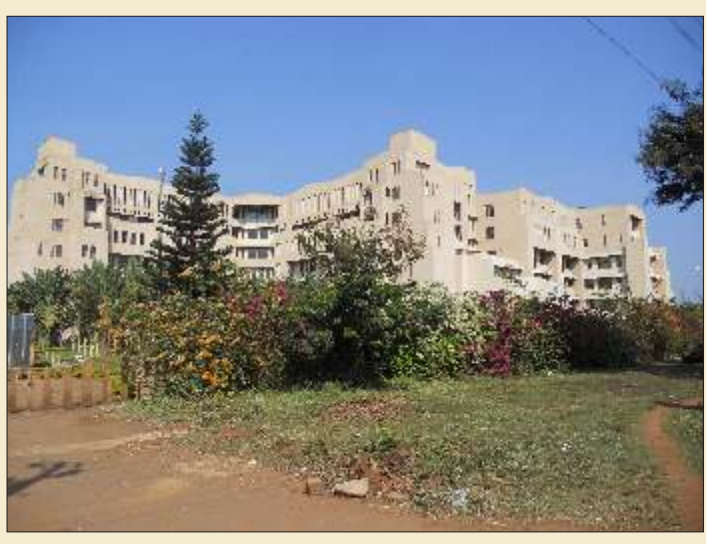
SDM College of Medical Sciences & Hospital, Dharwad