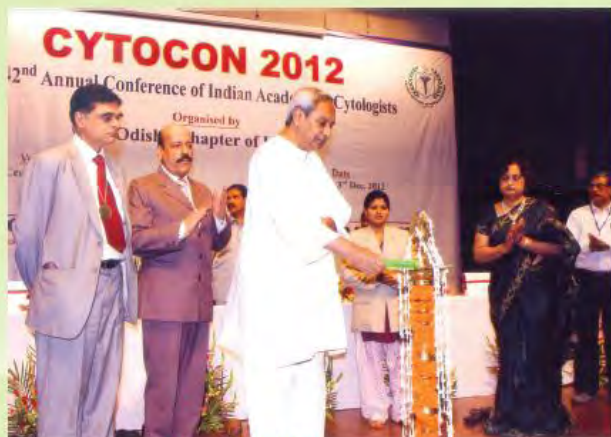
Hon'ble Chief Minister of Odisha Shri Naveen Patnaik inaugurating Cytocon 2012