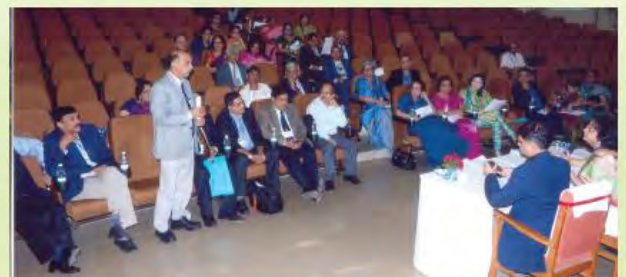
IAC General Body Meeting 2012