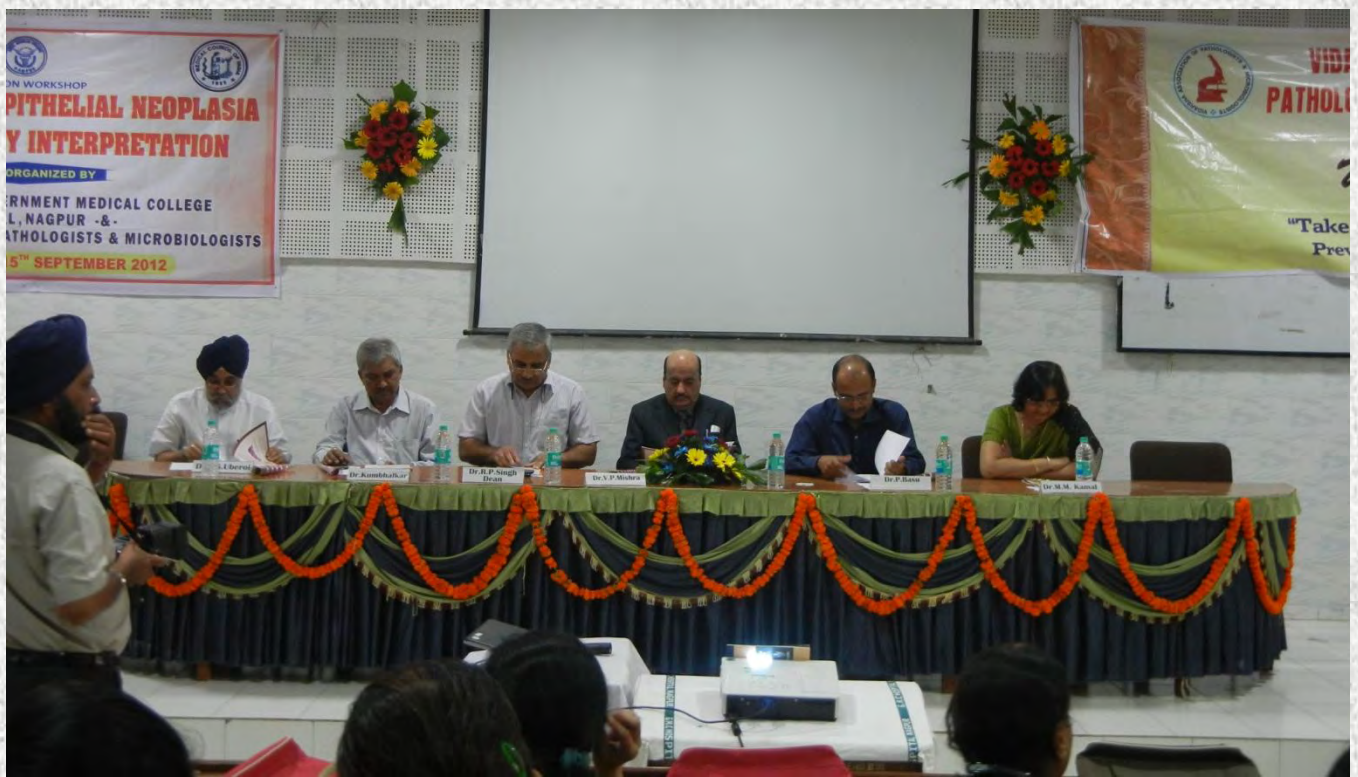
HANDS ON WORKSHOP - CERVICAL INTRAEPITHELIAL NEOPLASIA CERVICAL BIOPSY INTERPRETATION