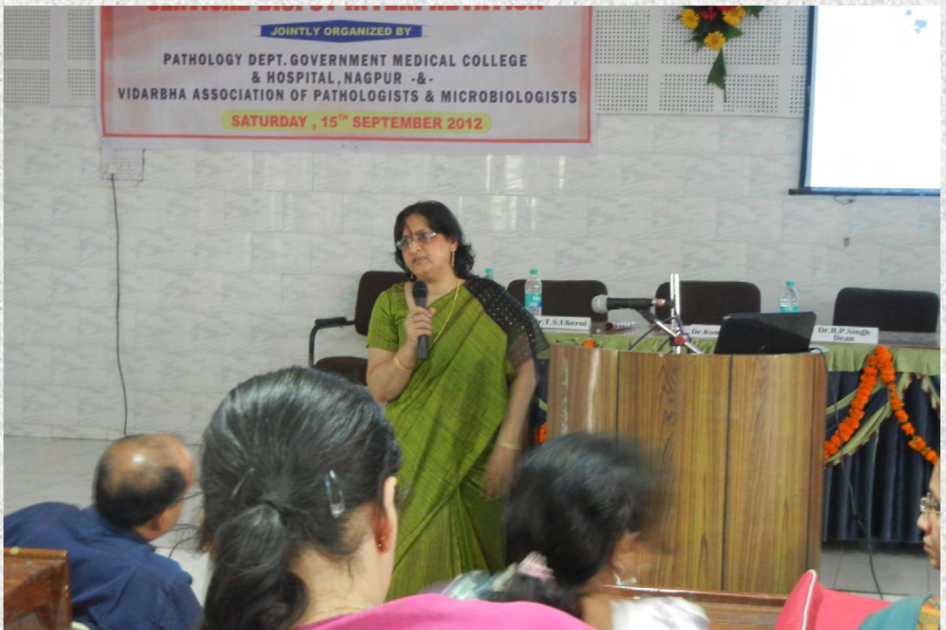
HANDS ON WORKSHOP - CERVICAL INTRAEPITHELIAL NEOPLASIA CERVICAL BIOPSY INTERPRETATION