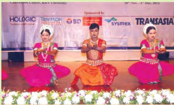
Odissi Dance following inauguration