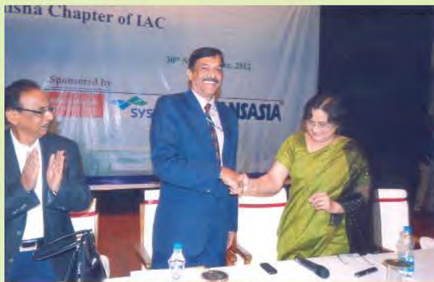
Exchange of Chair of IAC Secretaries