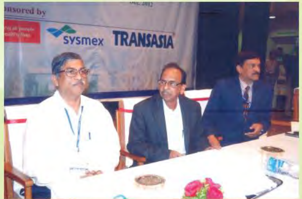
Valedictory Function Cytocon 2012

The valedictory session of the 42nd Annual