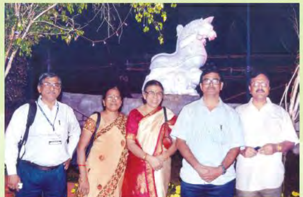
Members of the Organising Committee