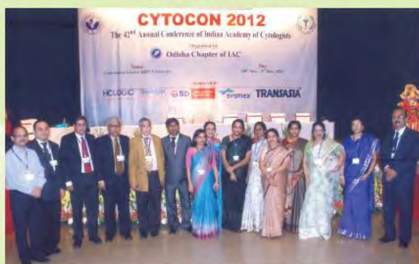
Resource Persons of CME