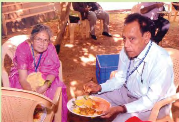
Seniormost Delegate Couple of Cytocon