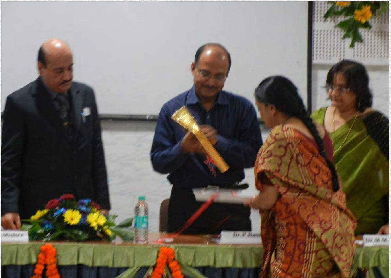
HANDS ON WORKSHOP - CERVICAL INTRAEPITHELIAL NEOPLASIA CERVICAL BIOPSY INTERPRETATION