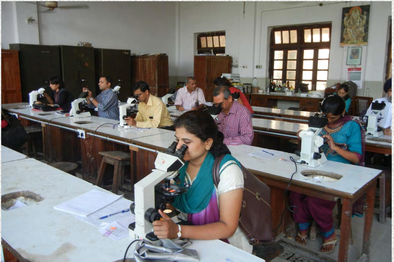
HANDS ON WORKSHOP - CERVICAL INTRAEPITHELIAL NEOPLASIA CERVICAL BIOPSY INTERPRETATION