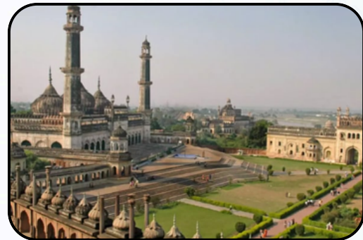
Bada Imambara (Lucknow)