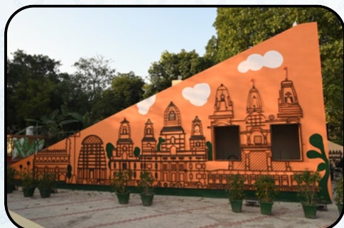
UP Darshan Park (Lucknow)