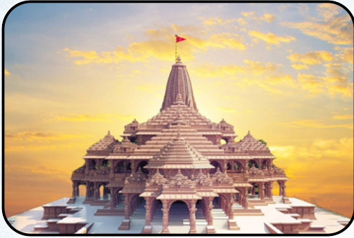
Ram Mandir (Ayodhya)