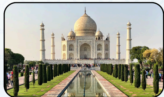
Taj Mahal (Agra)