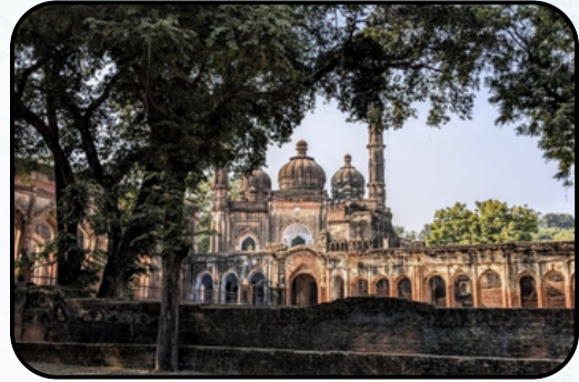
The Residency (Lucknow)