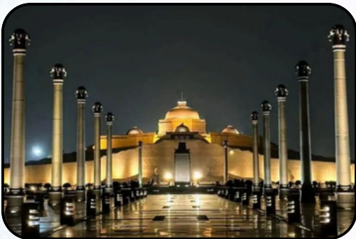
Ambedkar Park (Lucknow)