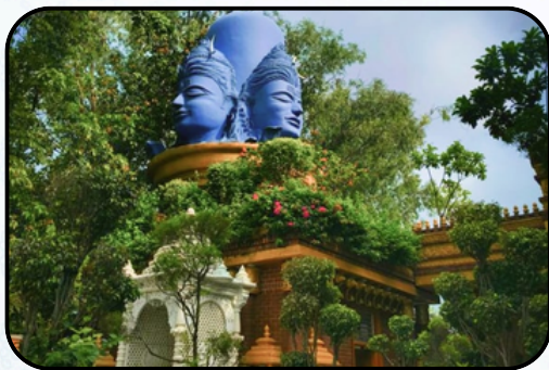
Hanumant Dham Mandir (Lucknow)